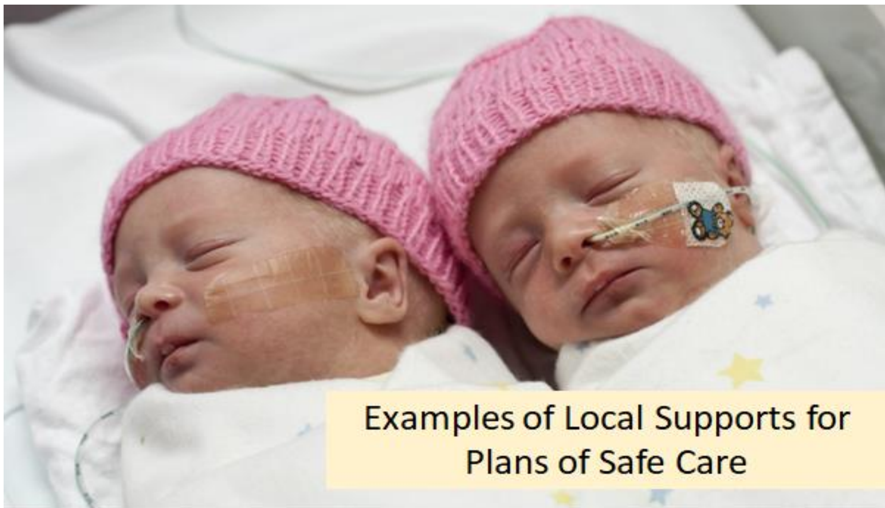
Examples of Local Supports for Plans of Safe Care